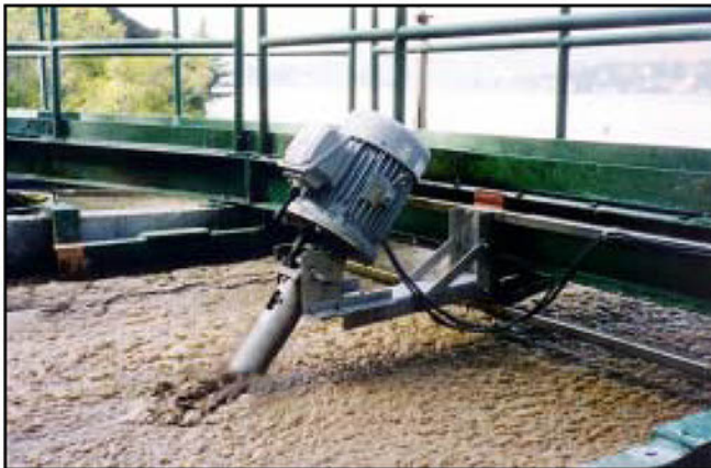
Typical TORNADO Aerator Installation.

All aeration takes place just below the surface so there is no spraying or splashing. Odors are reduced, and ice build-up is prevented with the unique self-heating design that keeps the system working in all seasons. Because the TORNADO is a totally self-contained unit requiring no additional blowers, pumps or mounting platforms, you save capital, installation and operating costs.