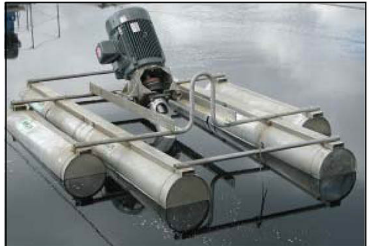
Float mounted TORNADO.